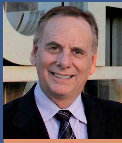
KEVIN HARTKE Mayor City of Chandler, AZ

Our city is also a great place for kids, with recreational activities, museums and more. Chandler Center for the Arts, for example, features a wide variety of Hispanic-infused music experiences (see below).◀