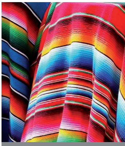
The Sarapes of Saltillo

Saltillo , but also of Coahuila and really all of Mexico . In Nahuatl , the word zarape means “covering blanket” and can refer to garments such as the lorongo , chal , gabán or poncho . In Saltillo , the sarape has been woven on a loom with woolen threads since 1591 and has distinctive elements.