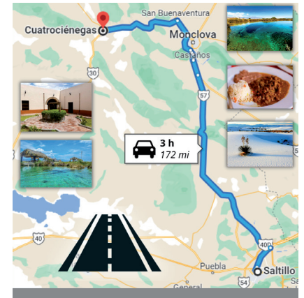
It is a three-hour drive from the magical town of Cuatro Ciénegas to Saltillo, Coahuila's capital city.

While Coahuila is also distinguished by its unique paleontological zones, it is equally popular for its modern infrastructure, high-quality services and the production of nationally and internationally renowned commercial goods.