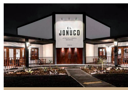
El Jonuco online

A few dishes in particular stand out: roasted sweetbreads, chicharrón caminero and criollo avocados. And then there are the incredible desserts: the delicious mesquite bread with dates and walnuts and the pear pie, which is a grandmother’s special recipe. <