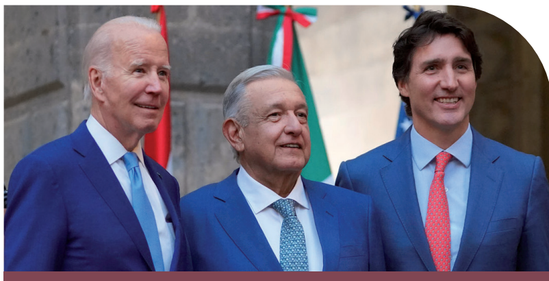
(l-r) U.S. President Joe Biden, Mexico's President Andrés Manuel López Obrador and Canadian Prime Minister Justin Trudeau