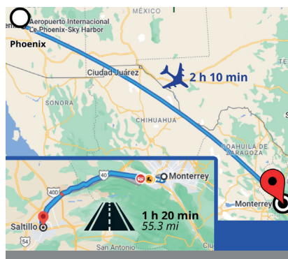
There is now an American Airlines nonstop flight between Phoenix and Monterrey.

activities, no matter what your interests are. I dare you to live your dreams and visit Nuevo León for the adventure of your lifetime. <