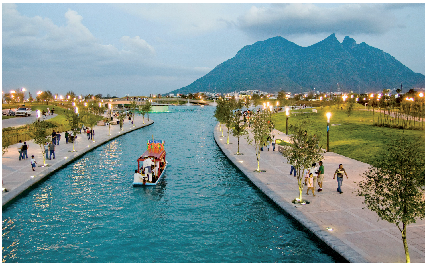
Paseo Santa Lucía