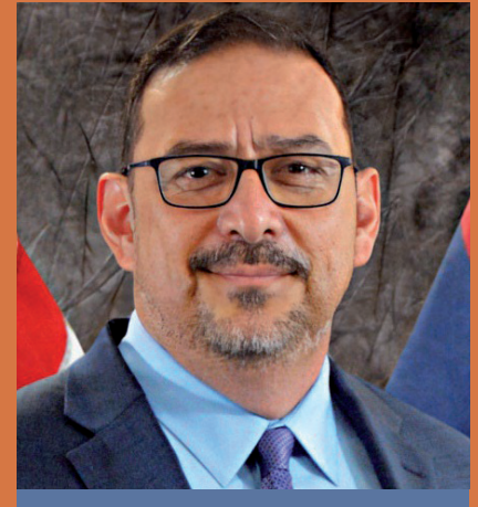
ADRIAN FONTES 21 st Secretary of State State of Arizona

When reckless politicians call for policies like shutting down the U.S.–Mexico border or imposing a 30% tax on remittances, they ignorantly threaten the livelihoods of Arizonans and our economy. As I have seen firsthand, trade with Mexico has shaped our past and it presents a future full of potential for both of our countries if effectively prioritized by our leaders and properly articulated to the public.◀